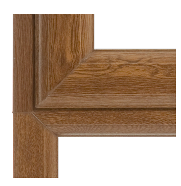
Close-up of fusion-welded sash corner and mid-rail overlap.