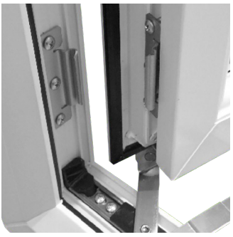
Hinge guards protect the hinged side of the opening sash for true multi-point locking