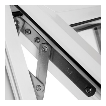
Friction stays for smooth and reliable operation all year round.