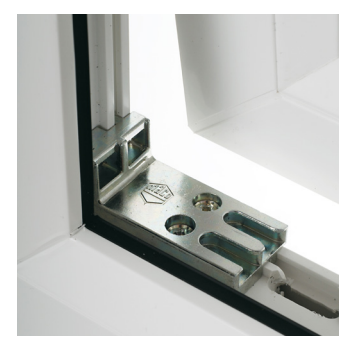
Window keeps with dual slots enabling a lockable 'slightlyajar' ventilation position.