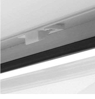
Pull-in blocks ensure tight compression of the sash gaskets against the frame.