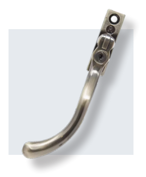
Traditional Tear Drop