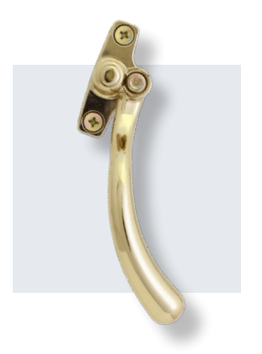
Contemporary Tear Drop