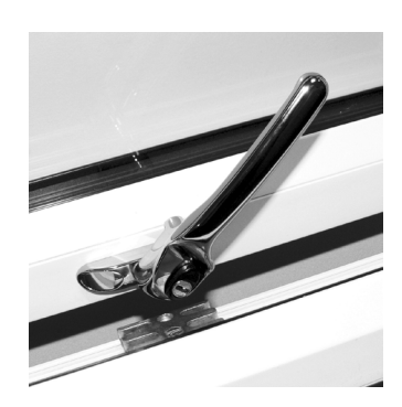
A range of key-lockable handles in offset, monkey tail and teardrop designs.