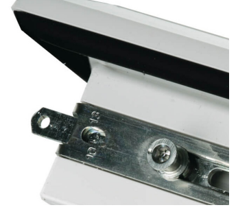
Extending shootbolts form another part of the multi-point locking system.