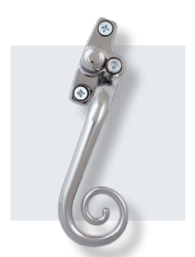
Contemporary Monkey Tail