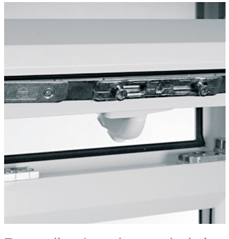
Expanding 'mushroom bolts' form another part of the multipoint locking system.