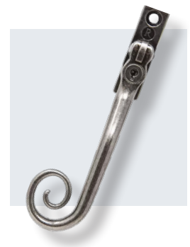
Traditional Monkey Tail